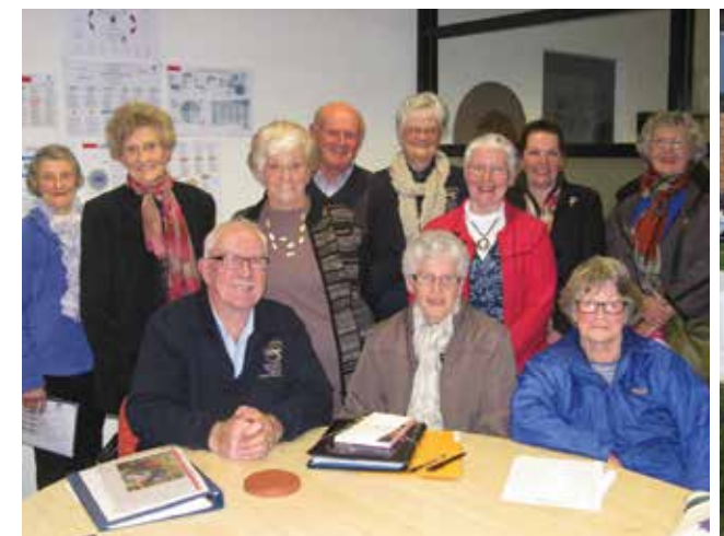
Friends of Hospice Golf Day 2013